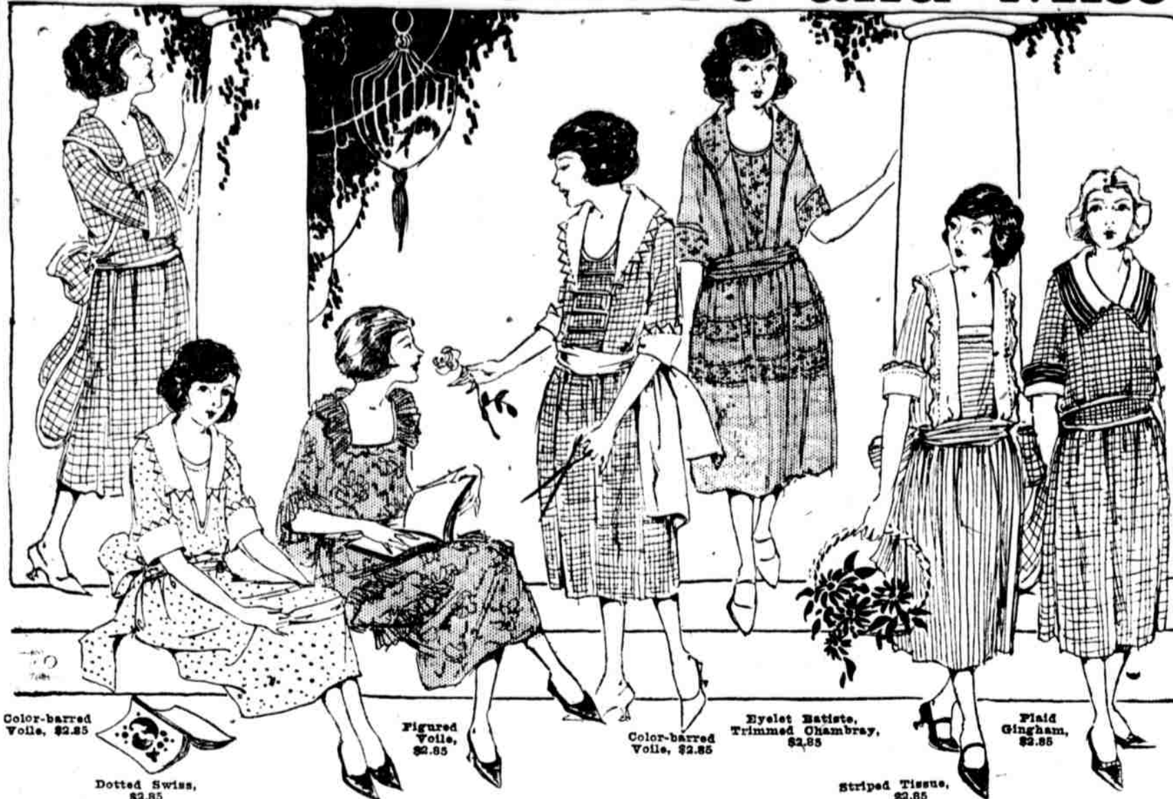
Color-barred Voile, $2.85 Dotted Swiss, $2.85 Figured Voile, $2.85 Color-barred Voile, $2.85 Eyelet Batiste, Trimmed Chambray, $2.85 Striped Tissue, $2.85 Plain Gingham, $2.85

—The Famous P'Agilon To-morrow at $2.85 Values $4.50 to $10