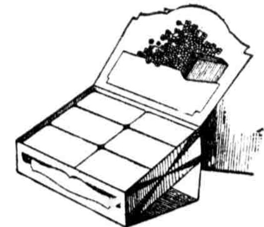
Besides Folding boxes and Shipping cases, Gair service includes the creation and manufacture of every sort of Advertising display. Above is shown our special Tinsley Display Container, which carries your product direct from your factory to a place of full display on the dealer's counter.