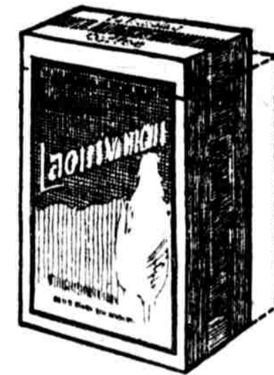
A shift of \frac{1}{4} of an inch in the dimensions of a coffee carton recently cut printing costs 40% and reduced the cost of stock over 16%. We may secure you similar savings in solving your package problems.

A letter or a telephone call will bring our representative at any time.