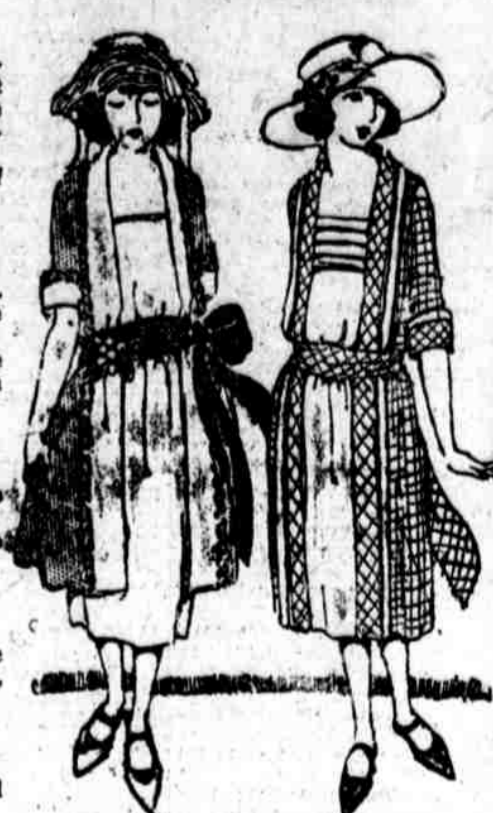
Misses' Organdie, Special at $12