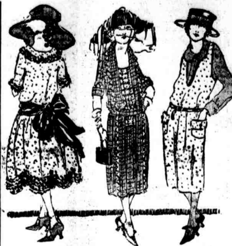
Women's Dotted Voile at $25