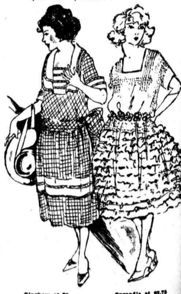
Gingham at $3