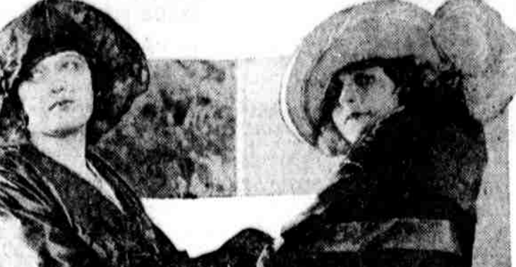
Even in July and August there are times when you want the comforting warmth of a wrap over your light thin frock in the evening...