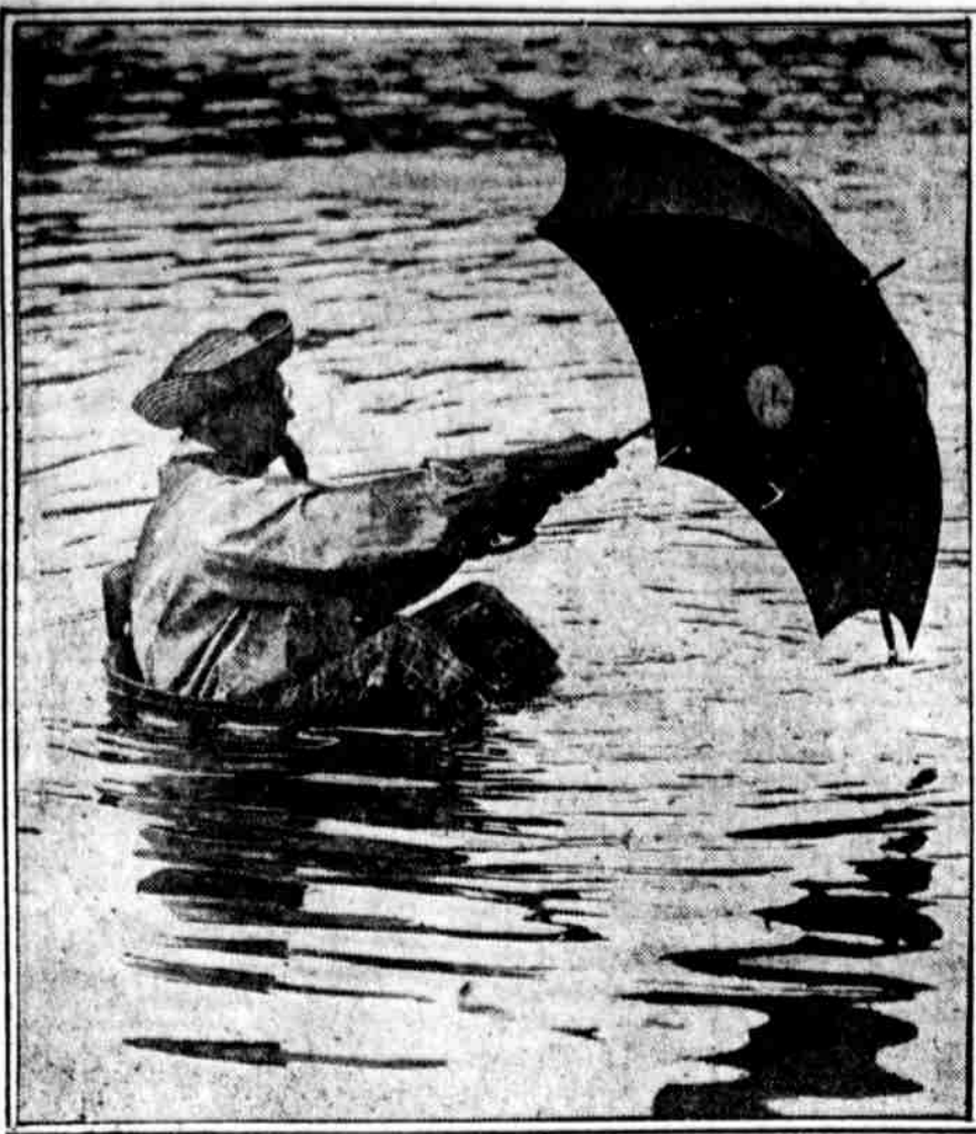
DO YOUR OWN SAILING. Borrow your neighbor's wash tub. Also ask if they can spare an umbrella. Then hunt a river or pond. All this must be done on a windy day.