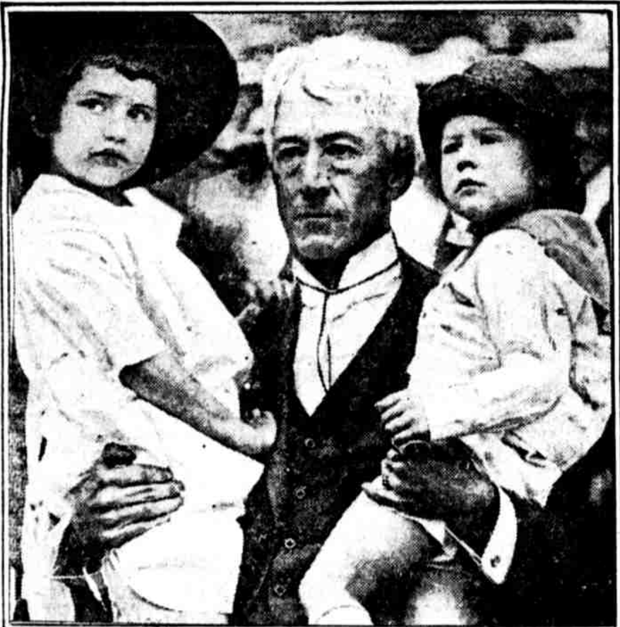
IN BROOKLYN. Federal Judge Landis, head of organized baseball, at the flag-raising ceremonies, on Ebbets Field. In his arms are the children of Zach Wheat, the Brooklyn outfielder.