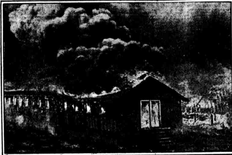
CAMP MERRITT'S THIRD FIRE. Virtually all the wooden buildings left in New Jersey's camp were destroyed. Fire companies from a score of nearby towns, including New York, gave assistance. Many explosives were destroyed.