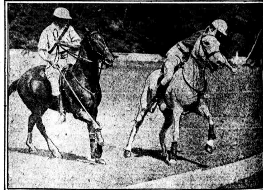
POLO PRACTICE. While the United States polo players were defeating the British four in England, local enthusiasts practiced at the Philadelphia Country Club. They are preparing for a game, planned for charity, on Saturday afternoon. L. P. S.