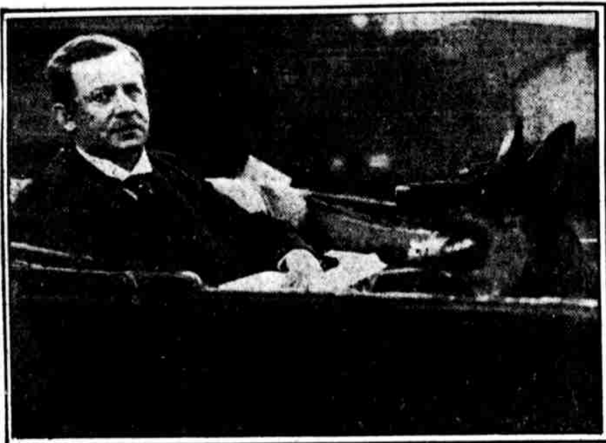
DR. ADALBERT KORFANTY, the Polish Insurgents' leader in Silesia, is one of the busy men of Poland. He was photographed at Oppeln, Upper Silesia, with the dog, his inseparable companion.