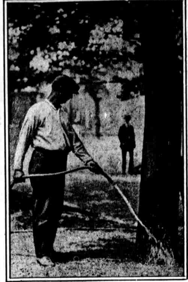
GIVING THE TREES A DRINK. In all of the parks of Philadelphia caretakers are busy, due to the lack of rain.