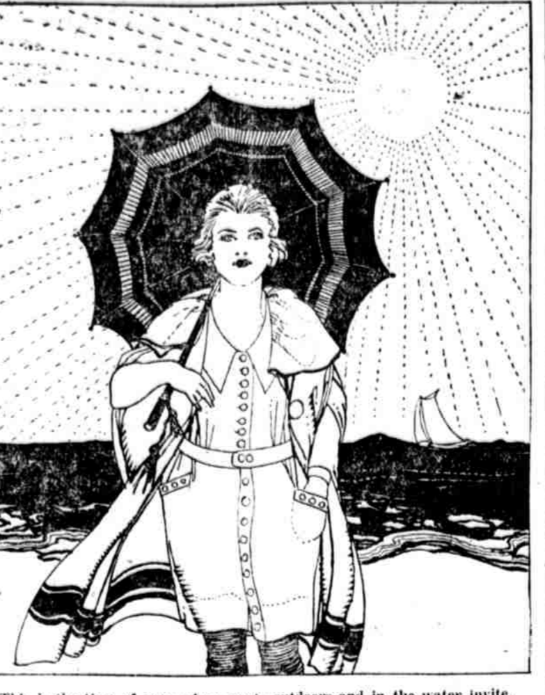
This is the time of year when sports outdoors and in the water invite, but complexion suffer

The first remedy for freckles is to prevent them as much as you can. When you go a-bathing or a-playing in the summer sunshine and breeze be careful. Carry a sunshade, wear a wide-brimmed hat, keep in the shade, throw a cape over neck and bare arms on the beach, or a shawl or sweater with a parasol and don't wear a hat that is too tight. Rub a little cold cream into your skin, then dust powder lightly over it.