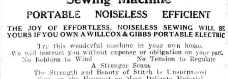
See This New Portable Electric Sewing Machine

See This New Portable Electric Sewing Machine PORTABLE NOISELESS EFFICIENT THE JOY OF EFFORTLESS, NOISELESS SEWING WILL BE YOURS IF YOU OWN A WILCOX & GIBBS PORTABLE ELECTRIC