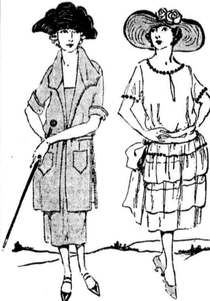
Shantung at $25

as provides for most vacation Needs. Such as—