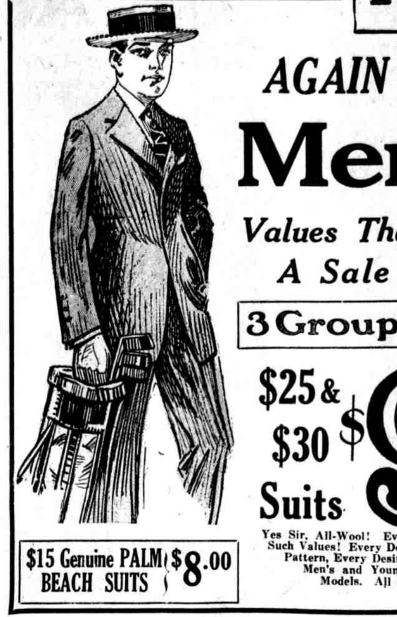
$15 Genuine PALM BEACH SUITS $8.00

FRANK & SEDER Eleventh and Market Streets