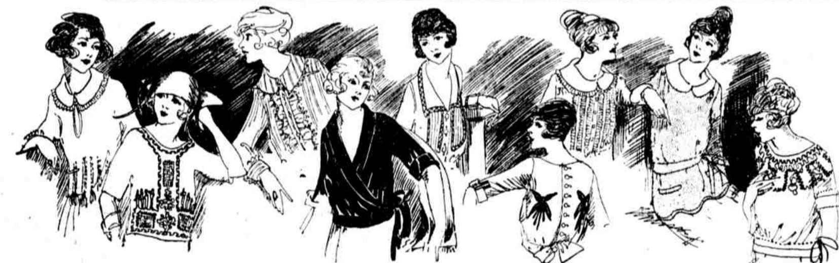
$5.90 $7.50 $1.90 $2.90 $1.45 $7.50 $1.90 $2.90 $2.90

One's eyes open with wonderment at the painstaking care and the hundreds of tiny stitches that went into the making and hem-stitching of each of these lovely frocks. They are of voile and batiste in rose, coral, white, orchid, flesh and combinations of white and color.