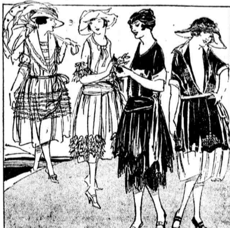
$12 $29 $25 $15

A Fourth, a Third and Half Less for Exquisite Summer Dresses in the Height of Fashion