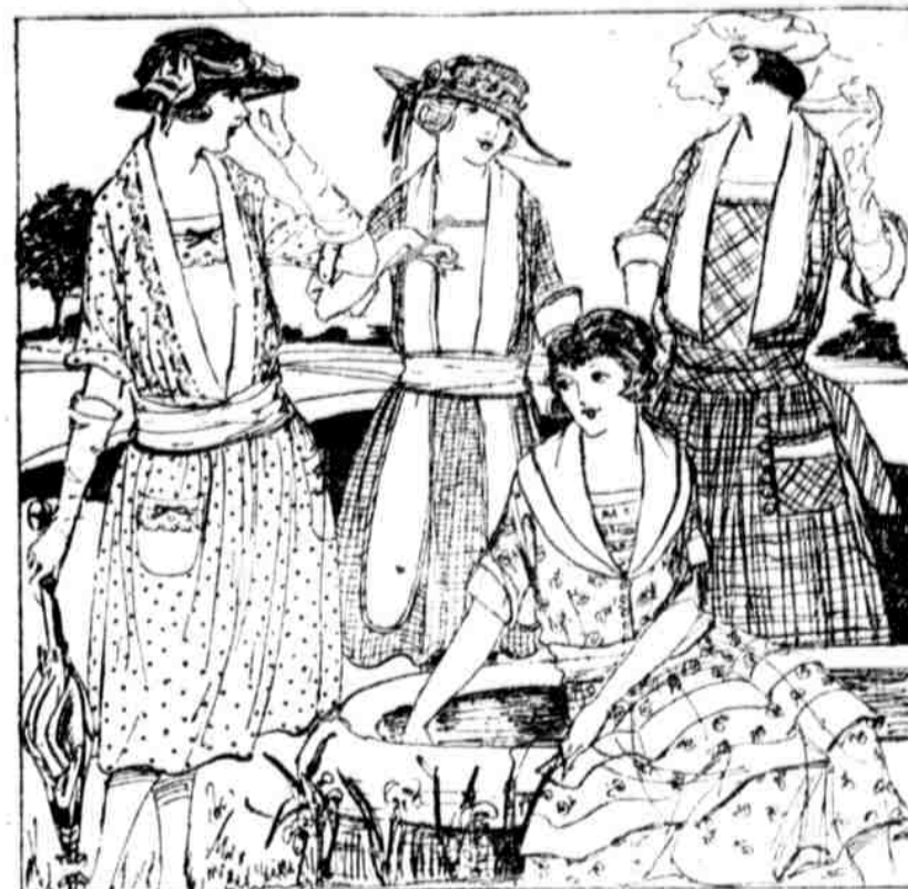
$8 $5.50 $10 $5

The same kind that we sold earlier for quite a little more. 22x44 inches.