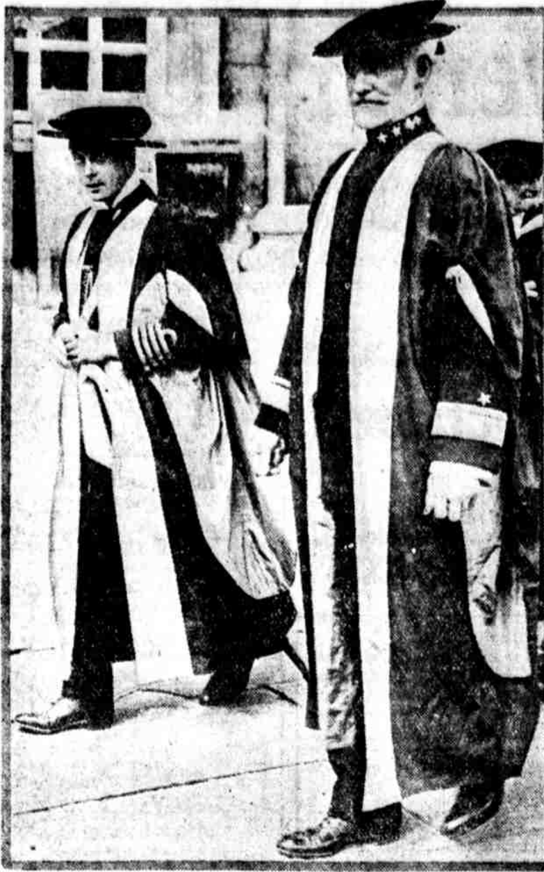
Rear Admiral Sims, who has been recalled from England for his caustic remarks on the Irish supporters in America, recently was given an honorary degree at Oxford.