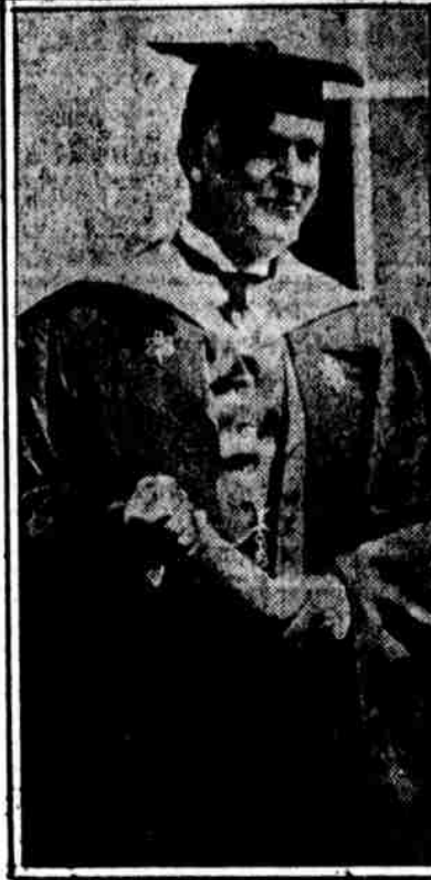
THOMAS MOTT OSBORNE, ex-waiver of Sing Sing, made an address at Swarthmore.