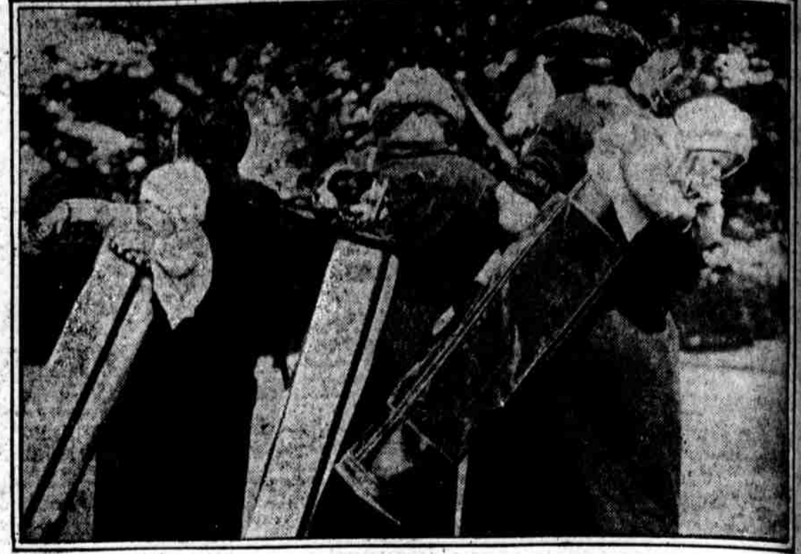
FOR THE BABIES AND PETS. It is no longer necessary to employ a nurse to care for the baby while you golf. California women have adopted a large caddy bag, which guarantees the youngsters plenty of fresh air.