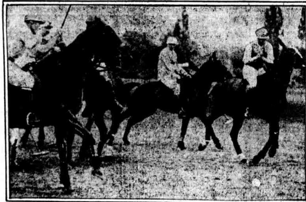
PRACTICE CONTINUES. Members of the American polo team battle against the Freebooters four on the green at Roshampton, England. The International contests start on Saturday at Hurlingham.