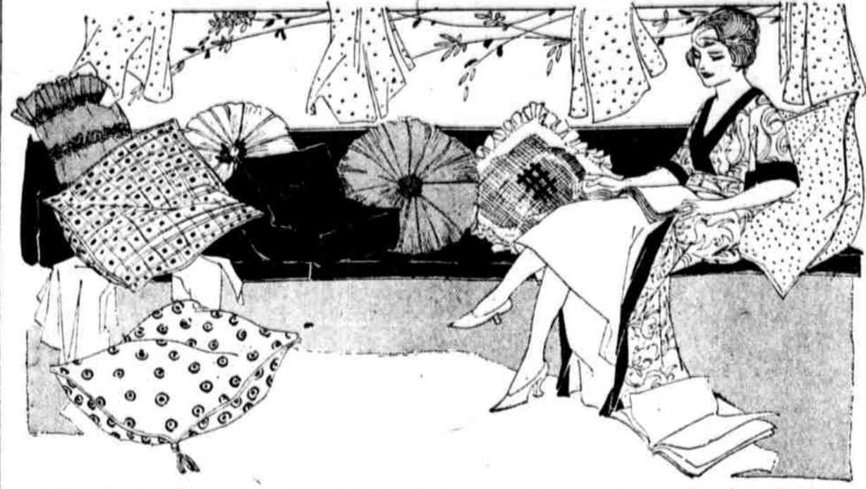
If you make your own cushions for living room, bedroom or porch you can choose the shape, color and style for yourself. Here are some suggestions: