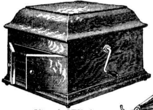
Victrola VIII, $50 Oak