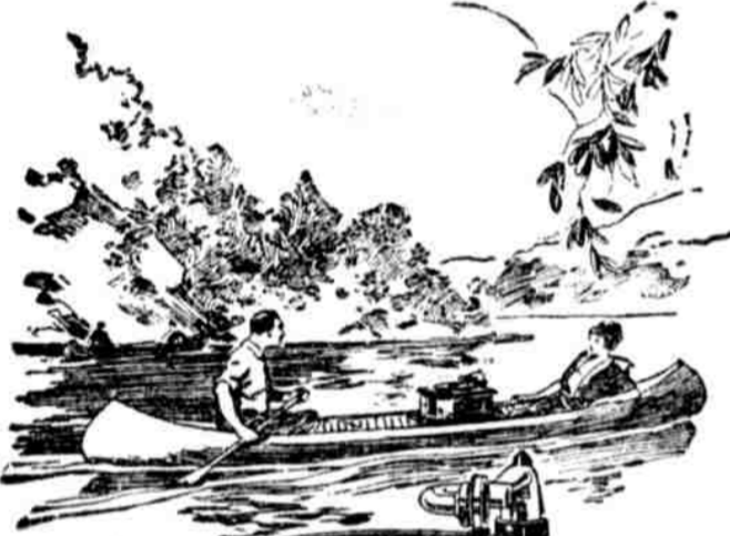
Victrola IV, $25 Oak