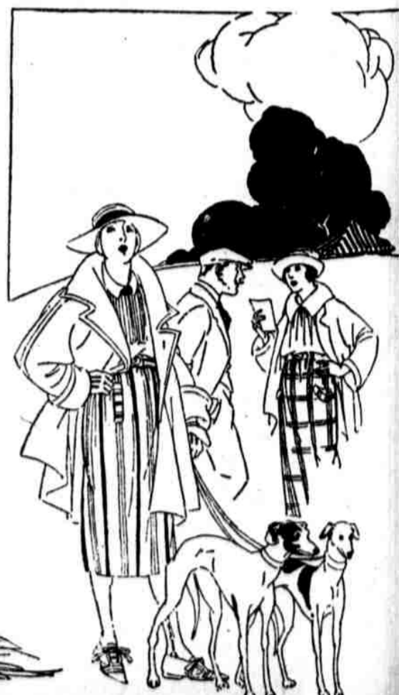
—Gimbels, Silk Salons, Second floor.