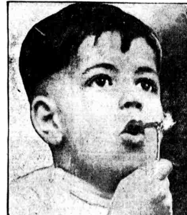
"SHE LOVES ME — SHE LOVES ME NOT." One of the lads of the St. Vincent's Home, Lansdowne, tries his wind on a dandelion head.