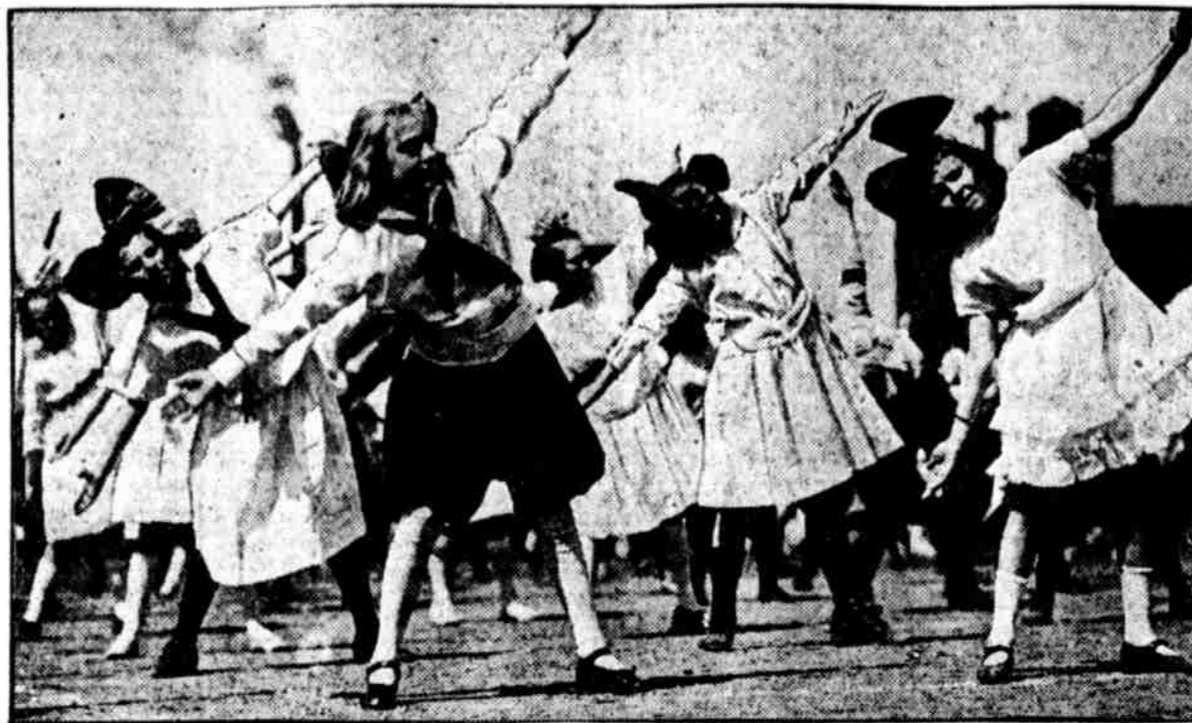
MASS DRILL. Pupils of the Vaughan-Dickinson public schools at their first annual play day, held yesterday at the Kensington Recreation Center. The girls did their drill work to notes sent forth from a talking machine.