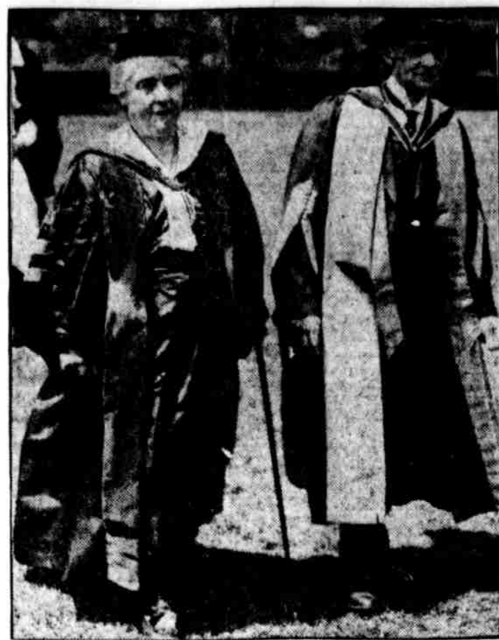
AT BRYN MAWR. Dr. M. Carey Thomas, president of Bryn Mawr, and Dr. Simon Flexner, yesterday's commencement orator, head the procession.