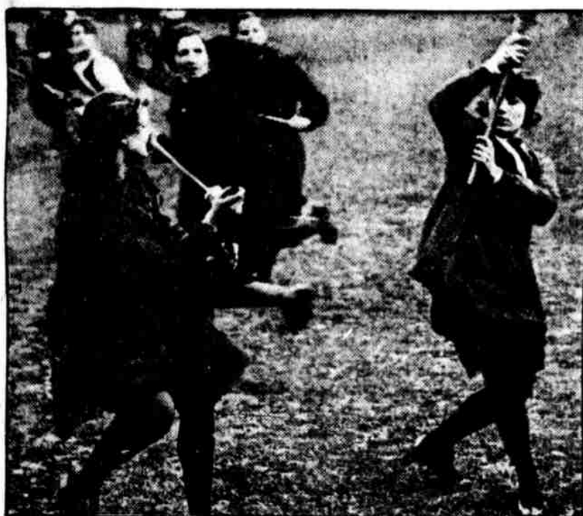
LACROSSE. British girls photographed as they play a fast game at Ealing, near London. They play a snappy game.