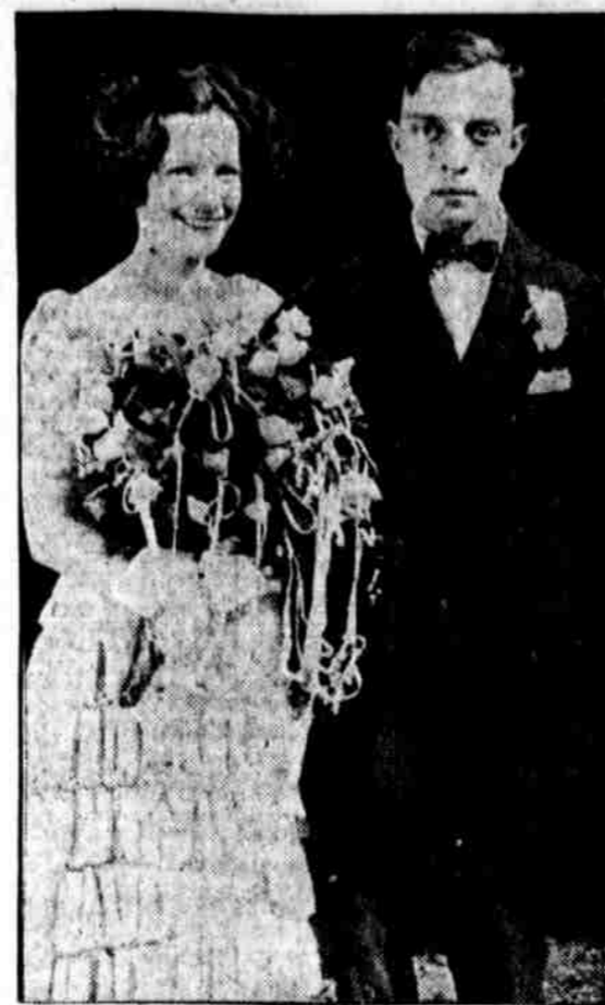
BRIDE AND GROOM. Natalie Talmage and Buster Keaton, well-known stars of Filmdom, at Edgewater View, Bayside, L. I., just after their marriage.