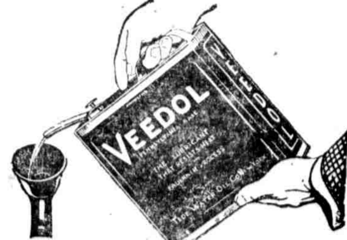
Made by the makers of Tydol