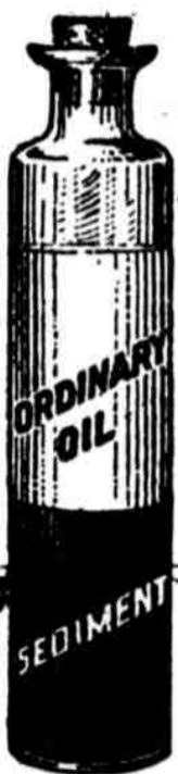
Ordinary oil after use Showing sediment formed after 300 miles of running