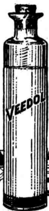
Veedol after use