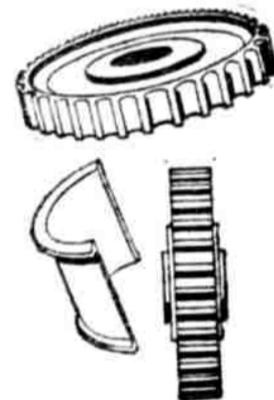
A dull, grinding noise in the transmission box is often due to faulty lubrication. If the grease coating here does not separate the meshing gears at all times, worn gear teeth are the result.

Distributed to dealers from 1519 South 55th Street, Philadelphia, Pa. (Phone, Woodland 1004)