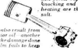
Scored pistons also result from the use of inferior oil—another illustration of the damage done when the oil film fails to keep the metal surfaces apart.