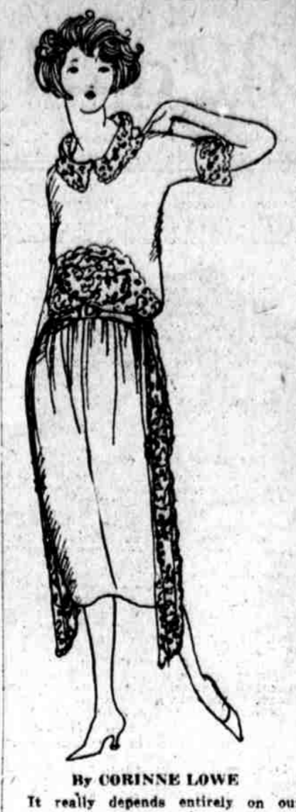
By CORINNE LOWE It really depends entirely on our

elbows. If you are a sister with the dimpled kind, you cling to the short sleeve and the long-glove bill. If, on the contrary, you are a sister with sharp, many faceted elbows, you seek sanctuary in the long sleeve—often the bell variety. Both kinds of sleeves are correct these days. The above frock of navy Canton crepe presupposes the more amiable elbow. This model is made on the simple lines now so fashionable. Its trimming consists of cut work, showing a foundation of antique red, and this trimming supplies the two side panels considerably longer than the skirt. These side panels, by the way, are still being much worn, even by the pioneer souls who love a new fashion.