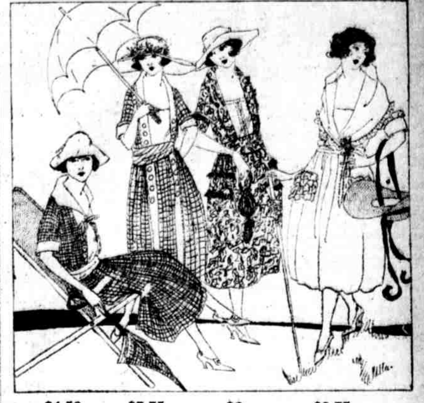
$4.50 $7.75 $6 $8.75

Fine for Summer, because they're cool and will stand a great deal of hard wear and frequent trips to the laundry. These shirts are cut over generous patterns without a bit of skimping. Shoulders fit comfortably, cuffs are soft and extra wide. In pin stripes, cluster stripes and two-tone stripes, showing all the good colorings that men like. (Gallery, Market)