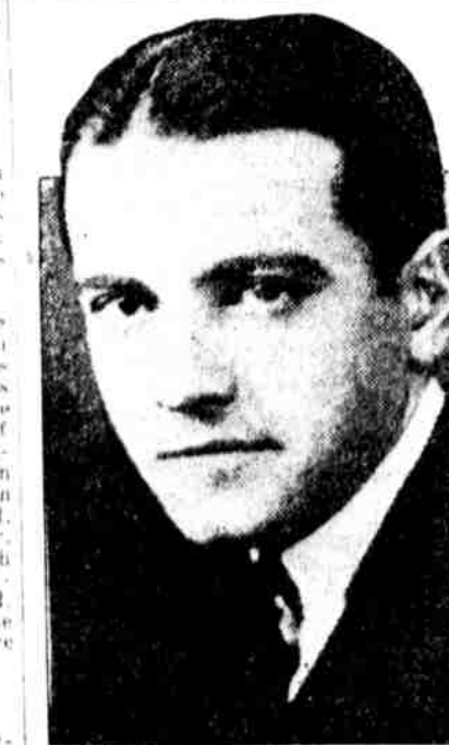
RICHARD BARTHELMESS Featured player with D. W. Griffith, who will become an independent star with a new company formed to exploit him.