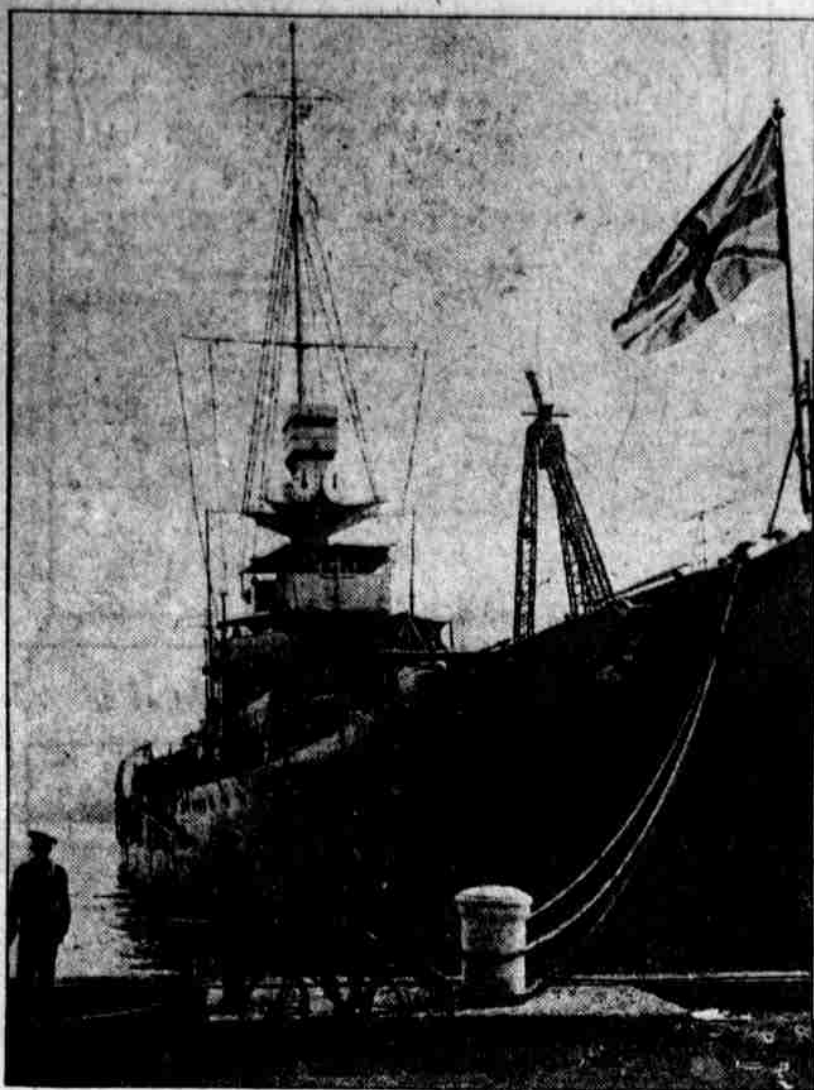
BRITISH WARSHIP. H. M. S. Calcutta, which is anchored in the harbor on a visit to Philadelphia for its officers and crew to take part in today's Empire Day exercises.