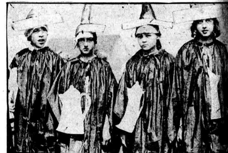
COFFEE DRINKERS. They were part of the huge modern health crusade staged by the Burlington County Schools at the Mount Holly Fair grounds yesterday afternoon.