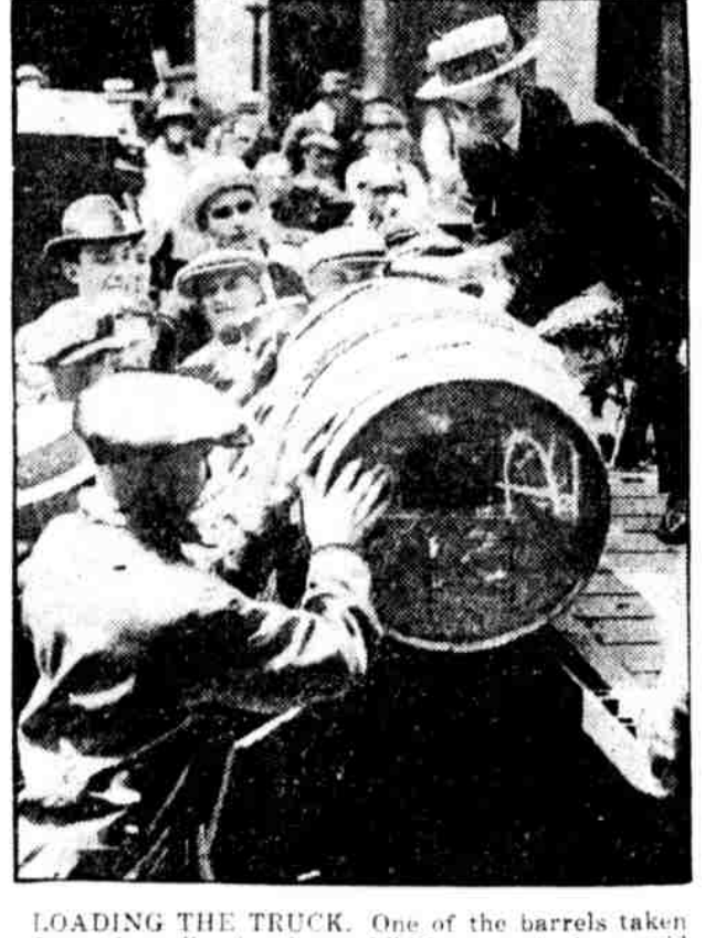
from the cellar by the prohibition agents in a raid at 719 South Third street yesterday afternoon.