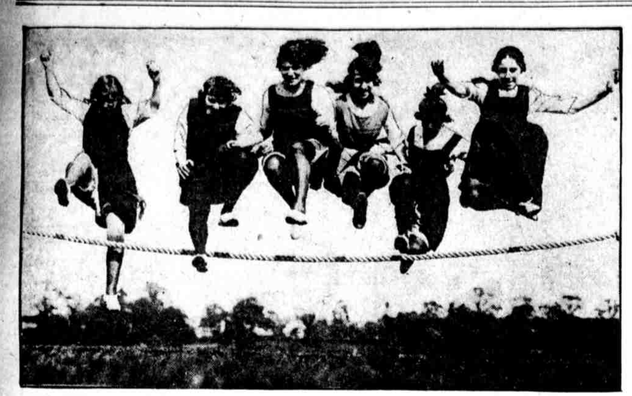
AN ACTIVE HALF DOZEN. English shop girls are being trained in athletics. The photograph was taken at Sunbury, England, in a field adjoining the polo grounds, where the American poloists are practicing.