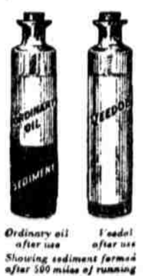
Made by the makers of Tydol