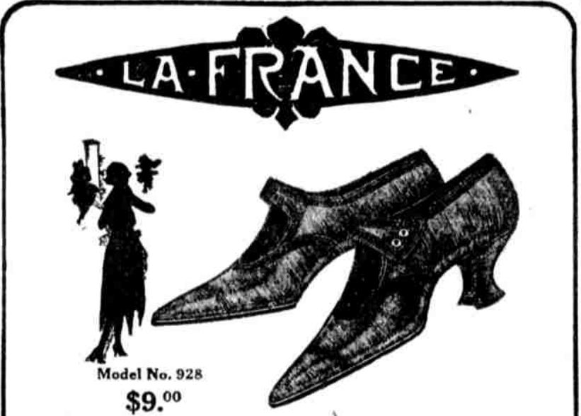
Model No. 928 $9.00

16-Button-Length White Silk Gloves $1.15 a Pair. Remarkable value. White silk of a trade-marked kind with slight irregularities in the weaving that class them as "seconds."