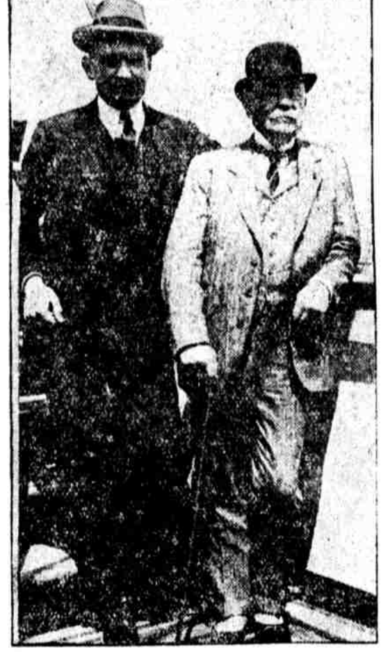
TWO PAGES. Thomas Nelson Page, ex-Ambassador to Italy, arrives on the Mauretania with F. Handley Page (left), the airplane inventor.