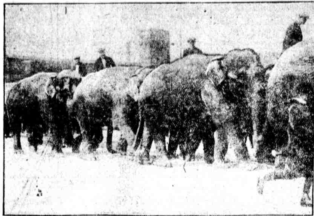
ELEPHANTS ARRIVING. They were held on the cars until the tents were ready for their care.

AS THE RINGLING BROTHERS AND BARNUM & BAILEY CIRCUS ARRIVED YESTERDAY