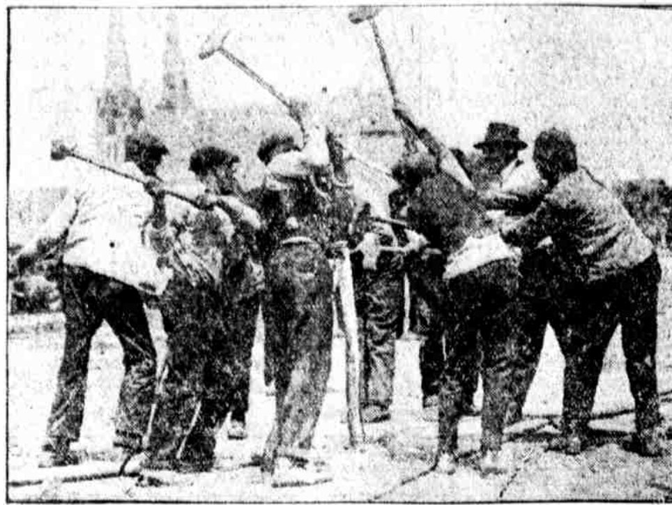
DRIVING A STAKE. Ten sledge hammers in action on a main tent stake on the circus grounds, at Nineteenth street and Hunting Park avenue, yesterday afternoon.