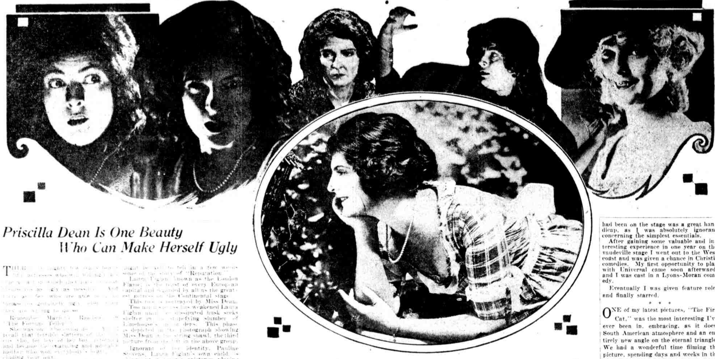
PRISCILLA DEAN AS HERSELF—AND AS OTHER PEOPLE