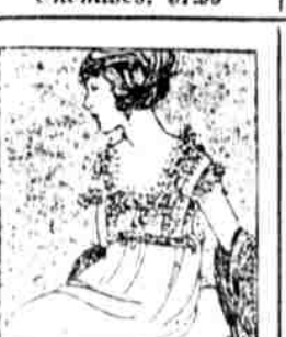
$3.00 Nainsook Gowns, $1.79