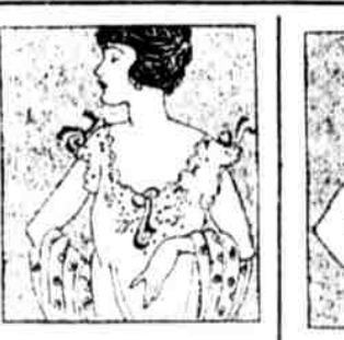
$5 Philippine Night $2 Lingerie Cloth Gowns & Envelope Night Gowns, 98c