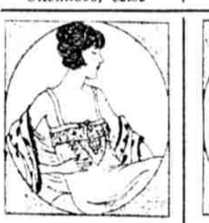
$3.50 Crepe de Chine Envelope