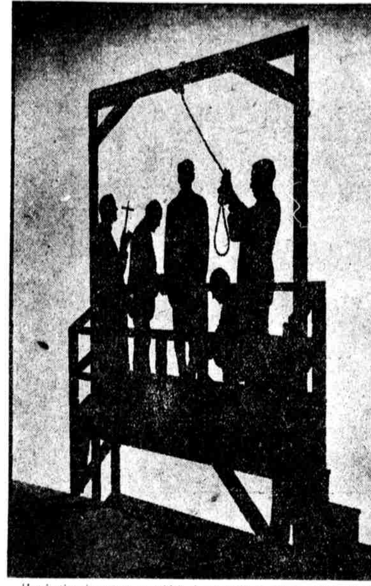
Here's the clever way in which the director of Pathé's 'The Devil to Pay' tried to present a lewd scene without actually presenting it.