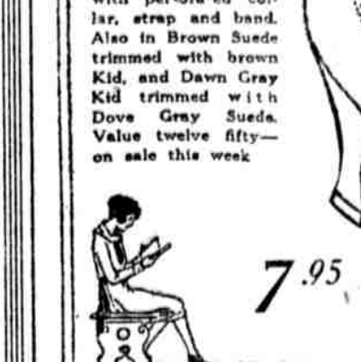
Model 2021—in the new shade of light Russia calf with perforated calf collar, strap and band, or in gunmetal Kid with perforated calf, strap and band. Also in Brown Suede, trimmed with brown Kid, and Dawn Gray Kid trimmed with Dove Gray Suede. Value twelve fifty—on sale this week!