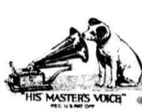
HIS MASTER'S VOICE

Victor Talking Machine Co. Camden, New Jersey