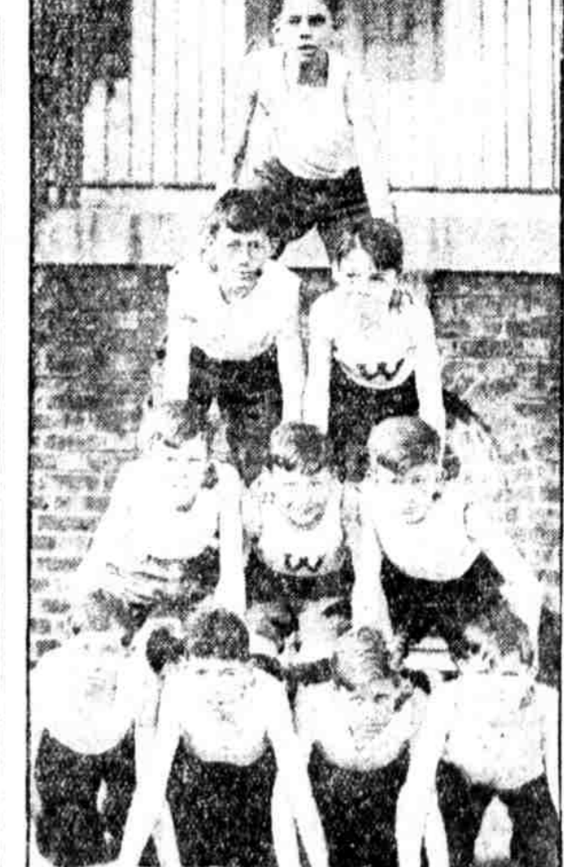
TEN GERMANTOWN ATHLETES. They formed a perfect pyramid and posed well for the photographer at the Waterview Recreation Center in Germantown.