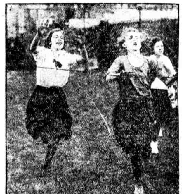
A FAST FIFTY-YARD RUN. Girls of the Waterview Recreation Center, Germantown, snapped as they reached for the finishing tape.