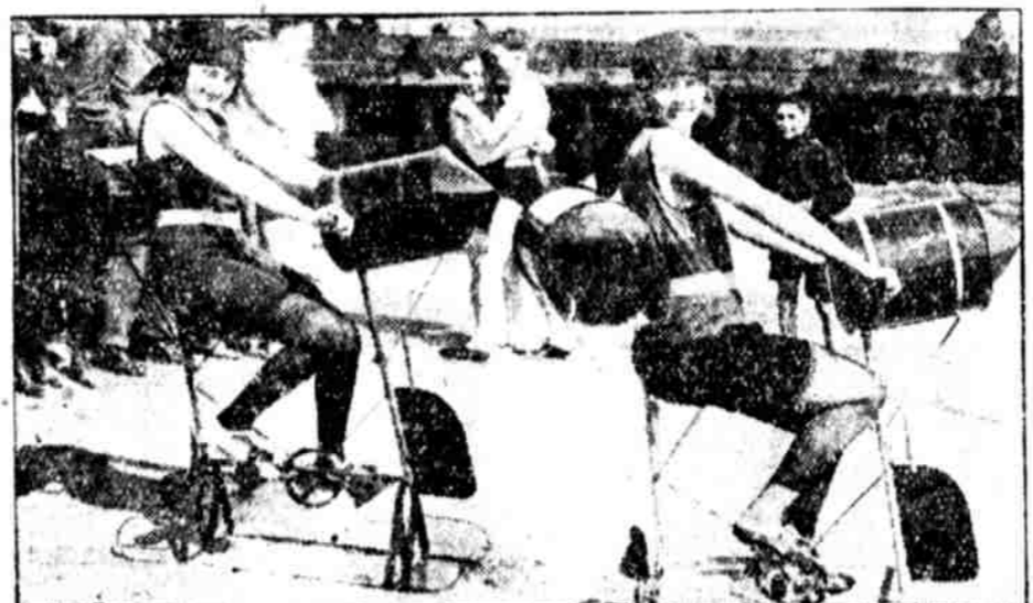
FLOATING WATER BICYCLES. A new sensation has been introduced at Coney Island. The girls are riding the machines, which are held under the water by the tanks in front and back. They are propelled like the ordinary bicycle. Hundreds were attracted by the new device on Sunday.