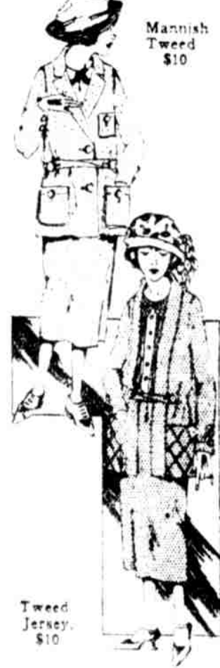
Mannish Tweed $10

"People who pay exorbitant prices for shoes today should blame nobody but themselves," said Mr. Hill, "It is true that many stores are laboring under enormous ground-floor rents and endeavoring to dispose of shoe-bought at the high prices that prevailed last fall, but in the Royal Boot Shops these conditions do not obtain. "Shoes, and I mean the very best styles for both men and women, can be bought today at prices that are lower than they have been since 1911, and we are buying at today's prices. This, and the very moderate rent that we pay for our up-to-date location at 1212 Chestnut street, means an actual saving of at least three dollars a pair based on the prices that are being asked for the same grades of footwear in other downtown and uptown shoe stores. "I have heard it said that women were nothing but price-worshippers before the first of last year, but I find that they are not willing to pay a fancy price when they can save here and get the same value and quality for several dollars less, particularly as I sell every pair with a money-back-if-not-satisfied guarantee. "Yes, business is very good—better than the first of last year, and simply because we have what gentlemen of the right price."