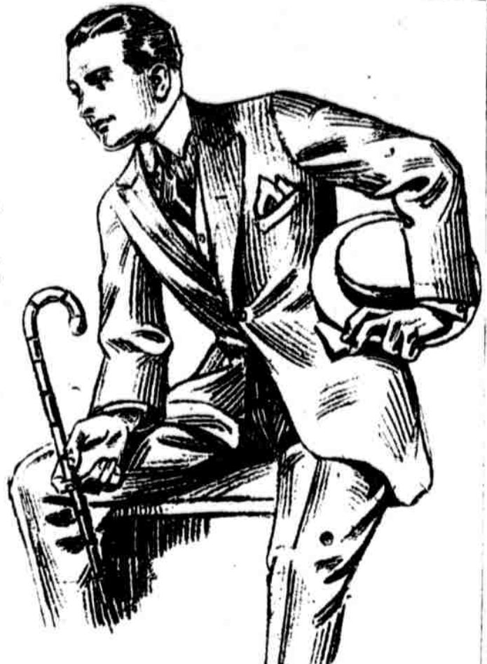
Gimbel's "Subway Store Day"

850 pairs in lot 600 plain gray and neat dark mixtures of durable all-wool cassimeres and 250 half worsted; neat dark striped patterns. Sizes to fit any ordinary sized man.