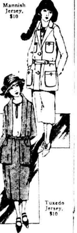
Mannish Jersey $10

Misses' Sizes, 14 to 18. Women's Sizes, 36 to 44.