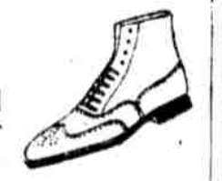
Gimbel's, "Subway Store Day"

Worth at Least Double 565 pairs of tan brogues and gunmetal lace shoes; broad and narrow toes in tan and black. All have Goodyear sewed leather soles. Some have rubber heels. Sizes 6 to 11.