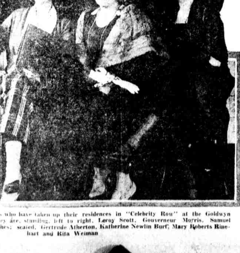
They are some of the noted authors who have taken up their residences in "Celebrity Row" at the Goldwyn studios at 47th St. and 4th Ave.

The picture of the construction, which extended to the setting of plots, plots, and characters, is being generated by producers, has been far-reaching.