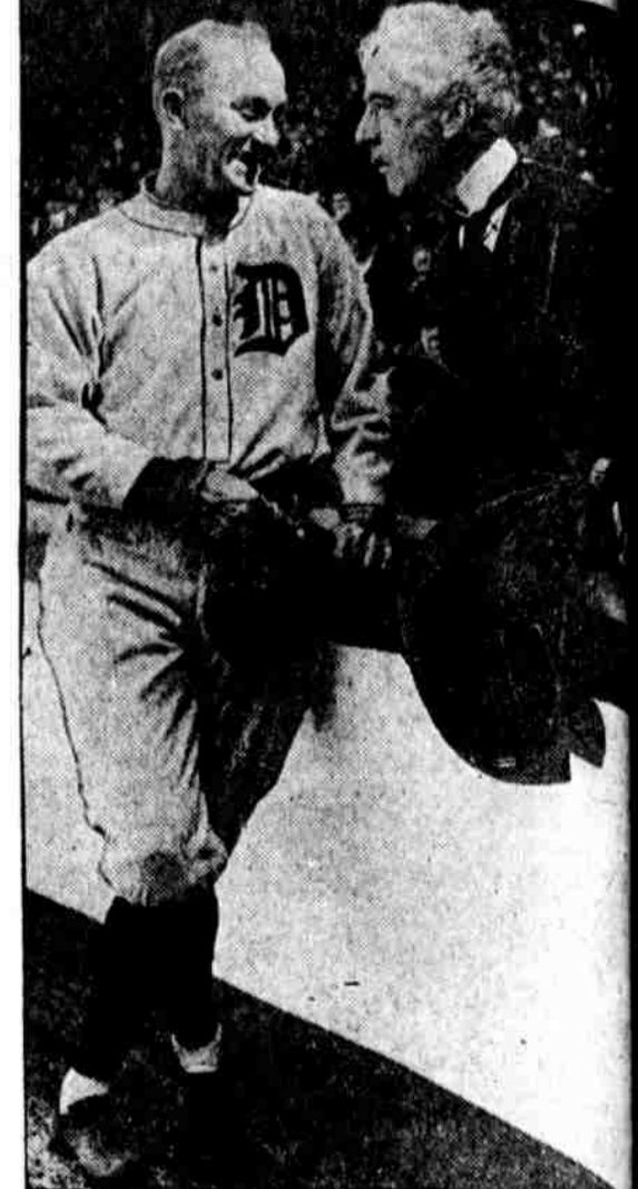
TY COBB CHATS WITH THE BOSS. Detroit's manager and Judge Landis, high commissioner of organized baseball, just before the opening game of the American League in Chicago.