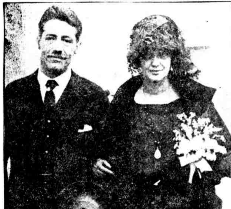
VIOLINIST AND HIS WIFE. Fritz Kreisler and Mrs. Kreisler, aboard the Olympic, as they start to spend the summer abroad.