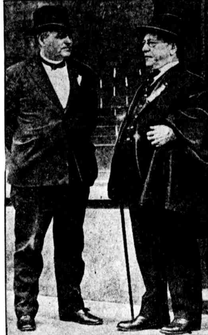
LABOR LEADERS. Frank Morrison (left), secretary of the American Federation of Labor, and Samuel Gompers, president of that organization, at the labor demonstration held in the Academy of Music yesterday.