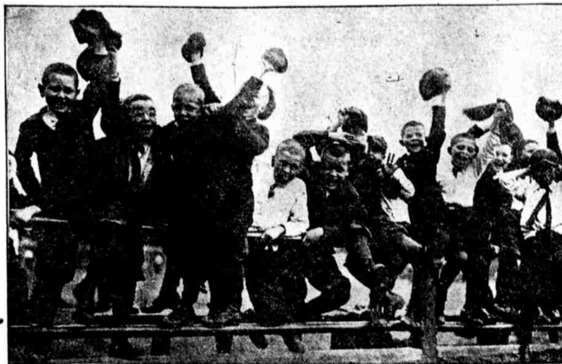
THEY SUPPLIED WINNING INSPIRATION. These are just a few of the younger students of Girard College who rooted hard and well for their track team, which won in the triangular track tilt against Frankford and Germantown High Schools on Saturday.