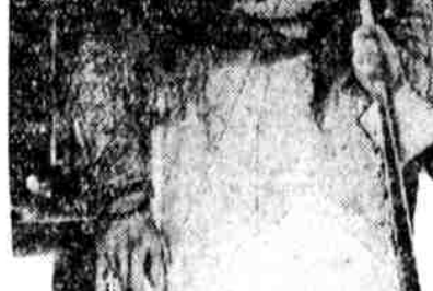
Nance O'Neill THE PASSION FLOWER WALWORTH