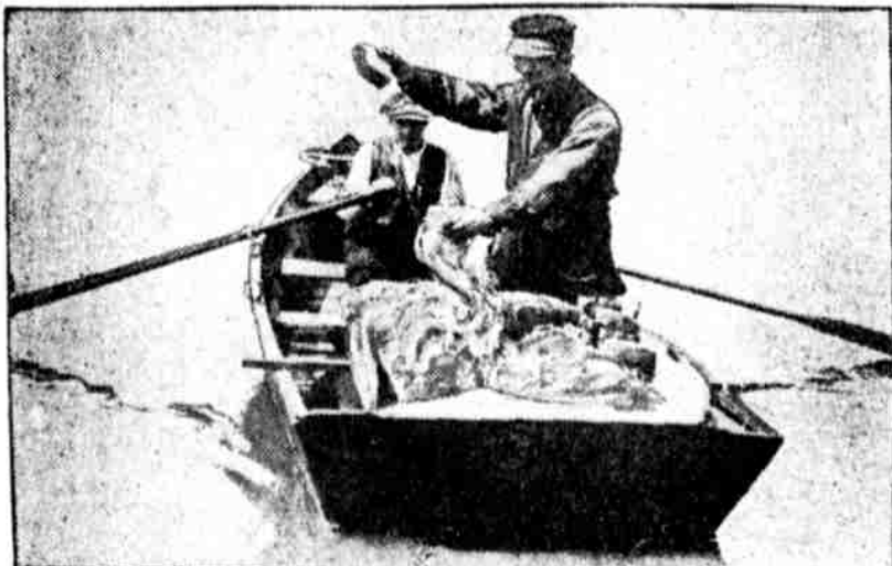
MUCH SHAD FISHING THESE DAYS. Fishermen in the Delaware river at Gloucester City make ready to drop their net.