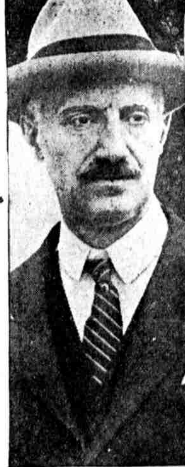
SAILS FOR ENGLAND. Bainbridge Colby, ex-secretary of state, was a passenger on the steamship Olympic.