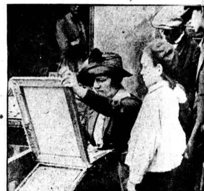
CHILDREN WATCH THE WORK. This photograph was taken as a student of the Academy of the Fine Arts did some work at Sixth and Chestnut streets.