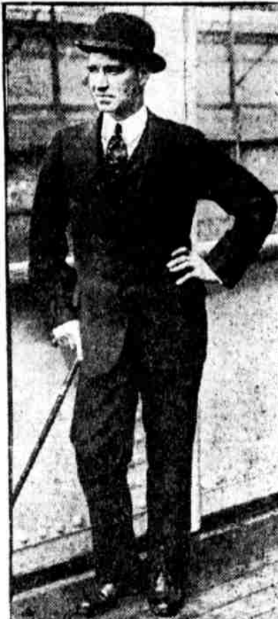
DEVEREUX MILBURN, captain of the American polo team, sails to England to give battle to the British polo representative.