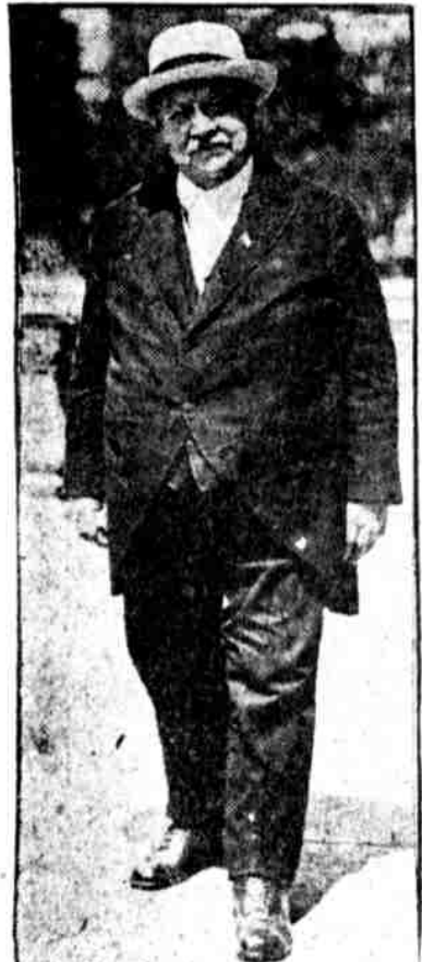
RUSHING THE SEASON. Representative William E. Mason, of Illinois, thinks it's warm enough for a Panama hat.