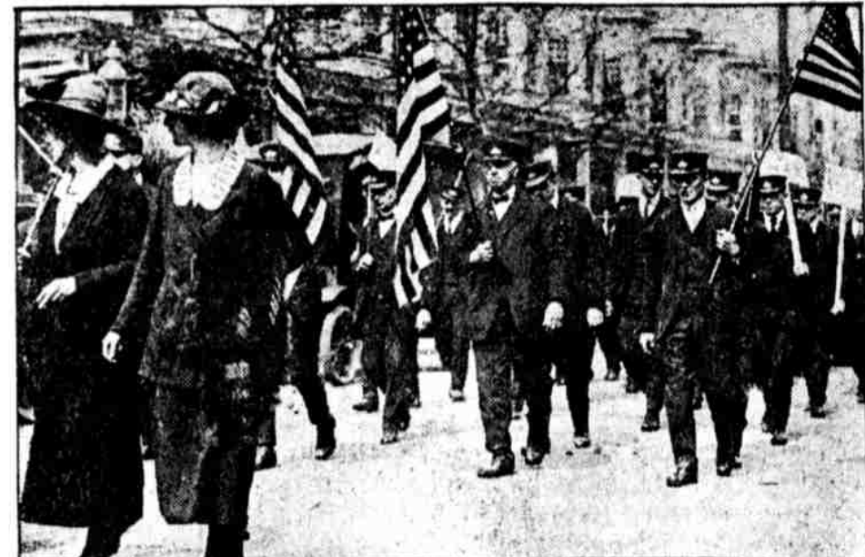
THEY ROOTED WELL, BUT NOT ENOUGH. Women and men from the Frankford car barn of the Philadelphia Rapid Transit Co. on their way to a ball game yesterday morning. Their team was defeated by the general office nine.