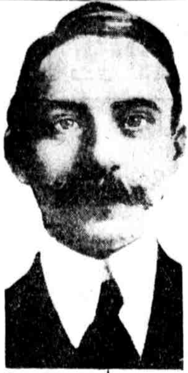
PROF. BERTRAND RUSSELL.