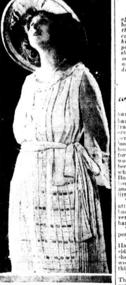
Photo by Ed. Moore. Editorial News. An ingenious trimming idea is this one of drawing the threads of silk crepe like drawn work and combining it with silk voile in a matching shade of soft pink.