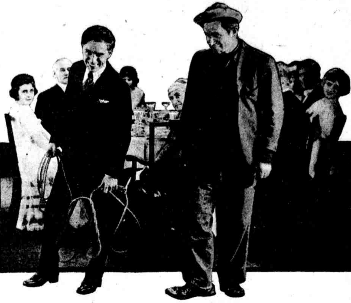
CHAPLIN AND ROGERS AMUSE STUDIO BUT INTERRUPT WORK

Charlie Chaplin came on the set one day during his recent visit to the Goldwyn Studios, while Will Rogers was making some of the scenes of "An Unwilling Hero."