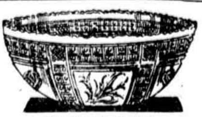
8-in. Berry Bowl, $3.75 6-in. Berry Bowl, $4.50, instead of $10

Light colors and the deeper blues, wistaria, jade green and rose. —Gimbels, Second floor