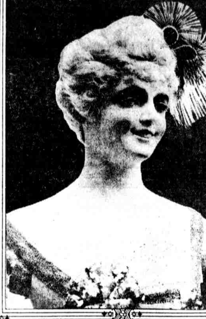
But wouldn't you love to have a complexion like hers? Below are given some hints about keeping your skin clear and smooth

IN TREATING complexion ills, the liberal use of water, externally and internally, is necessary. Get the twice-daily bath habit. Warm water at the end of the day, with a brush scrubbing, and in the morning either a plunge, a shower or sponge.