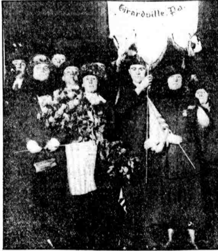
THE HOME FOLK. This group headed the delegation that came from Girardville, Schuylkill county, where Cardinal Dougherty was born. They stood at Broad and Sanson streets.