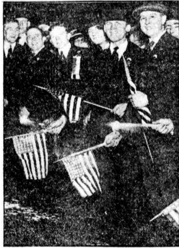
MEN AND BOYS FROM ST. MARTIN'S. This was part of the group that gave the Cardinal a tremendous ovation last night at Broad street and Indiana avenue.