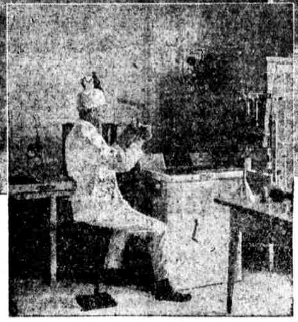
A complete laboratory system of testing ingredients guarantees absolute purity in Abbotts Ice Cream.