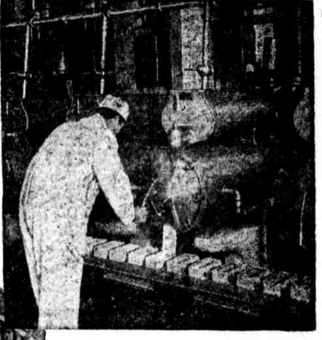
Filling the machine-filled packages that bring Abbotts Ice Cream direct to you from the freezer, untouched by hand.