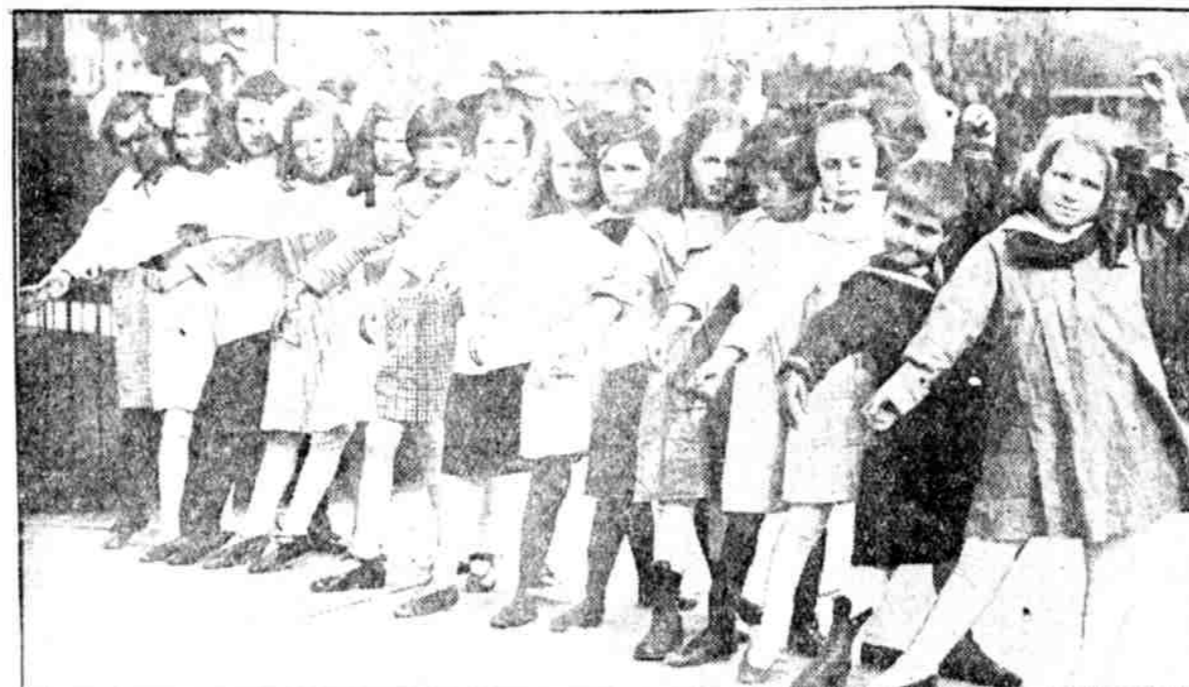
YOUNGSTERS IN DANCING CLASS. Instructors at the Waterview Recreation Center, Germantown, teach the children a few new steps, as they plan for the May Day fete, which will be held May 14