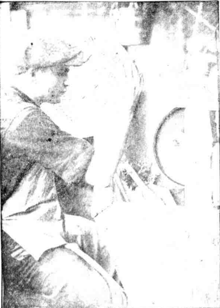
CUTTING AN ILLUMINATING GLOBE. The work is done on an emery wheel at the Gill Glass Co. Here, cut-glass manufacturers, Amber and Venango streets