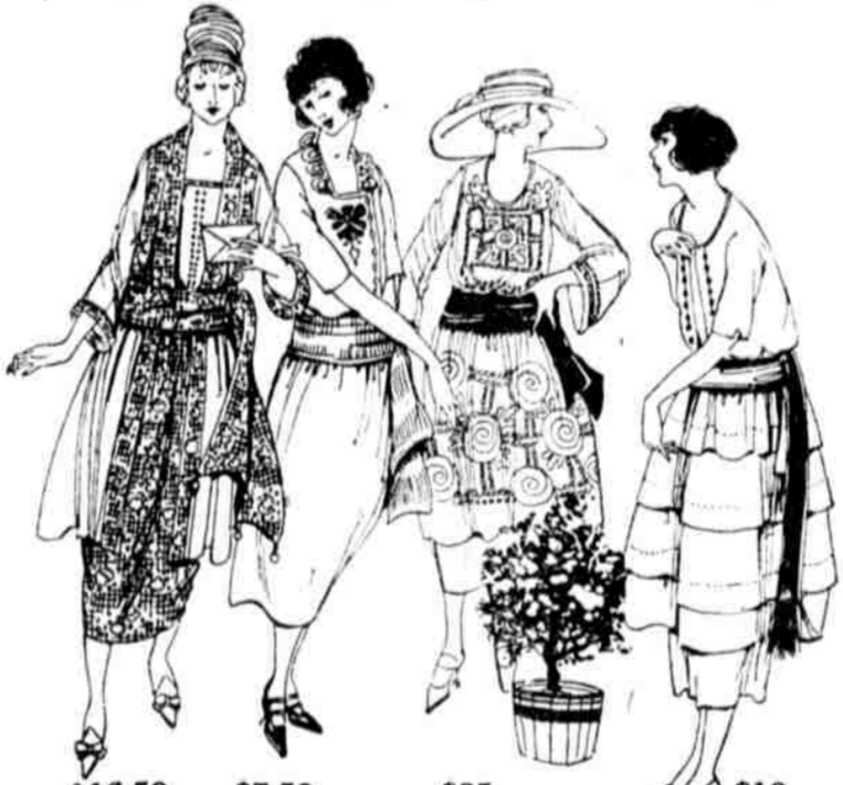
$16.50 $7.50 $25 $10

4-Pound Cans Epsom Salts, 18c Can A big, new shipment has just come to sell for less than half what it would be regularly. Recommended for bathing purposes, rheumatic joint saturations, etc.