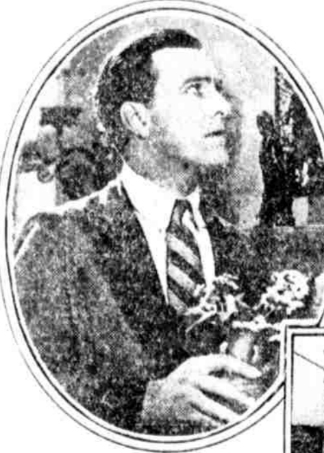
THOMAS MEIGHAN, THE EASY ROAD, Stanley