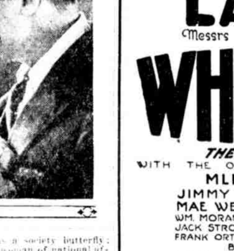
MAE WEST, THE BIGGEST SHOW ON TOUR, Shubert