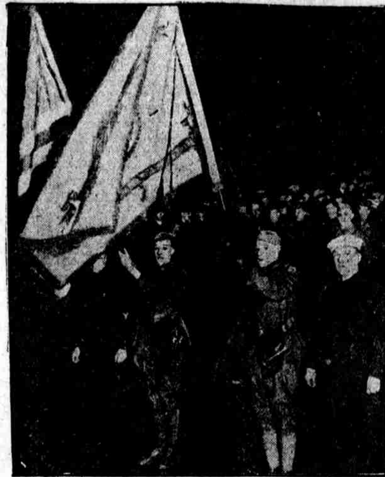
HEAD OF AMERICAN LEGION DIVISION. The color bearers were snapped as they left Broad and Diamond streets. They welcomed the orders to start.