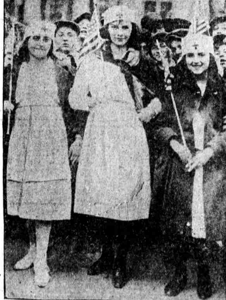
AT INDEPENDENCE SQUARE. These three school girls, dressed as Red Cross nurses, were right up in the front row during the speech making yesterday afternoon.