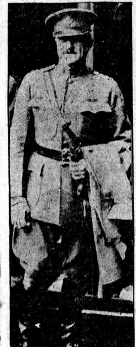
GENERAL PERSHING ARRIVING at Broad Street Station late yesterday afternoon.