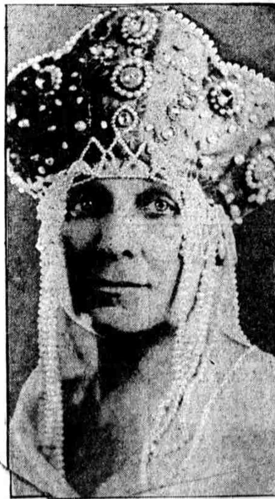
WITH RUSSIAN HEAD DRESS. Mrs. J. Borden Harriman, who will appear at a ball to be given on April 12, in Washington, for the Russian relief.