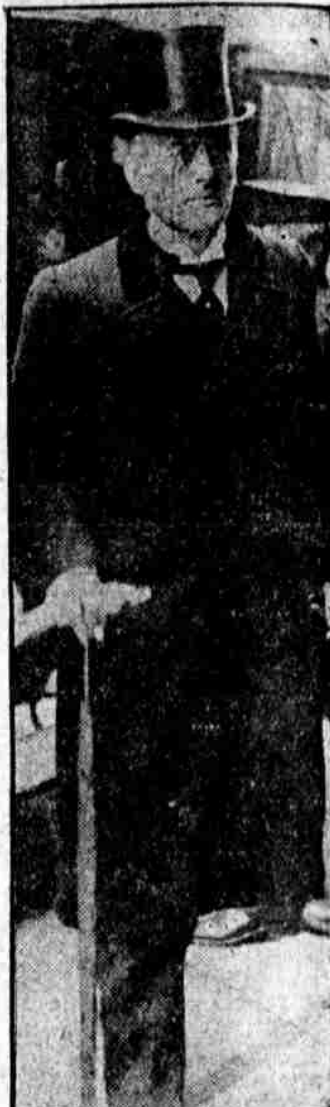
AUSTEN CHAMBERLAIN. He was on his way to assist in selecting a new leader for England's Conservative party.