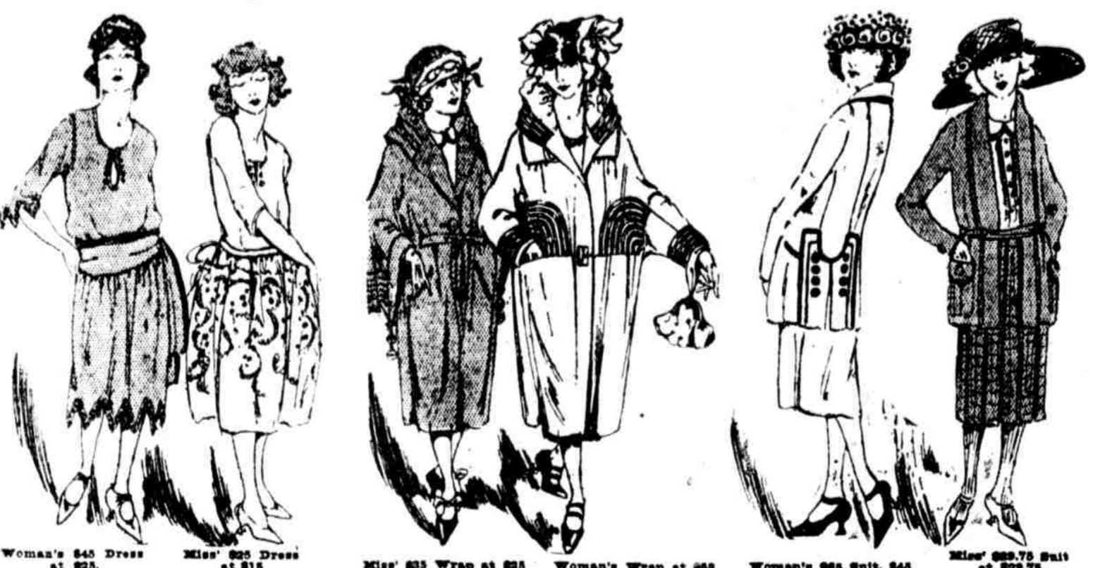
Woman's $45 Dress at $25. Misses' $25 Dress at $18. Miss' $25 Wrap at $25. Woman's Wrap at $25. Woman's $25 Suit, $45. Miss' $25 Suit at $22.75.

With the lovely Kitten's Ear Crepe-Satin Dress pictured as one perfectly delightful example. The hem—and sleeves—are in Vandyke points. And every point is bordered with jet-beads that are almost more buttons than beads! Smartly embroidered Tricotines, besides. And tucked mignonettes. And tailor-stitched tricotines. Elaborately eyeletted Crepe de Chine. And hand-beaded Georgettes.