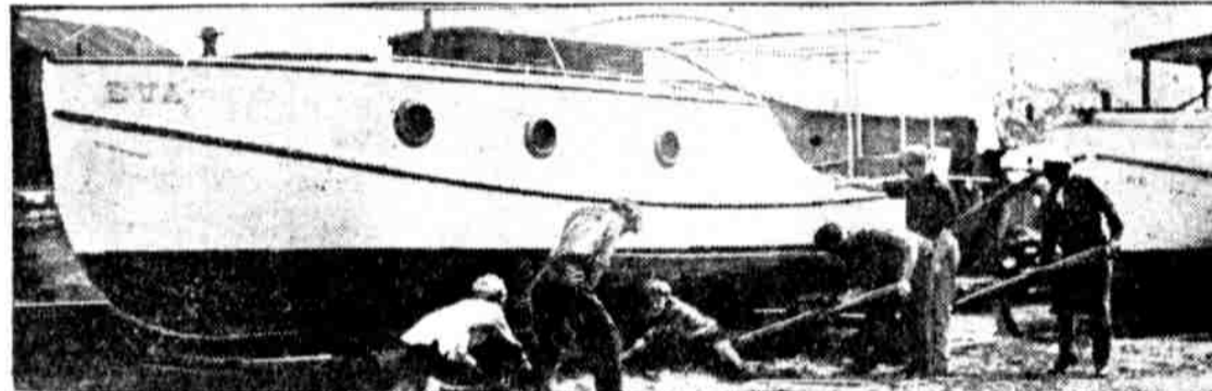
SUNDAY AT ESSINGTON. Everybody in sight was assisting the owners of "Eva" in the spring launching. The men are at work in front of the Riverside Yacht Club.