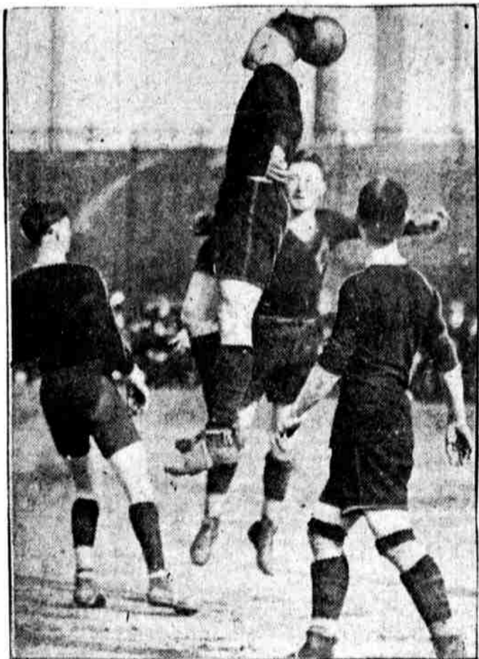
HEADING THE BALL. A member of the Hohlfeld team was snapped in this elevated position while they were being defeated by the Hardwick-Magee soccer team in the final game for the Hohlfeld challenge cup.