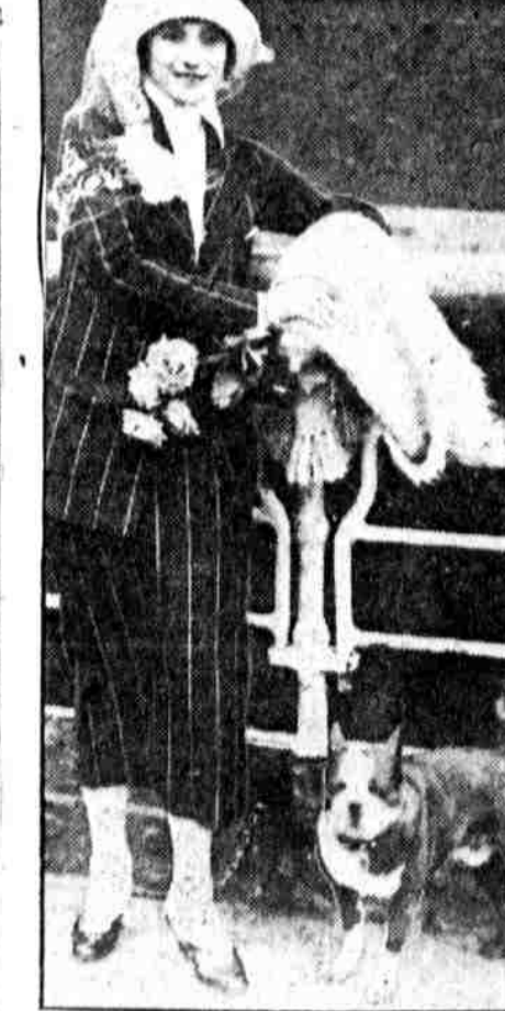
ON HER WAY TO EUROPE. Madame Pavlova, the Russian dancer, sailed on the S. S. Finland from New York on Saturday.