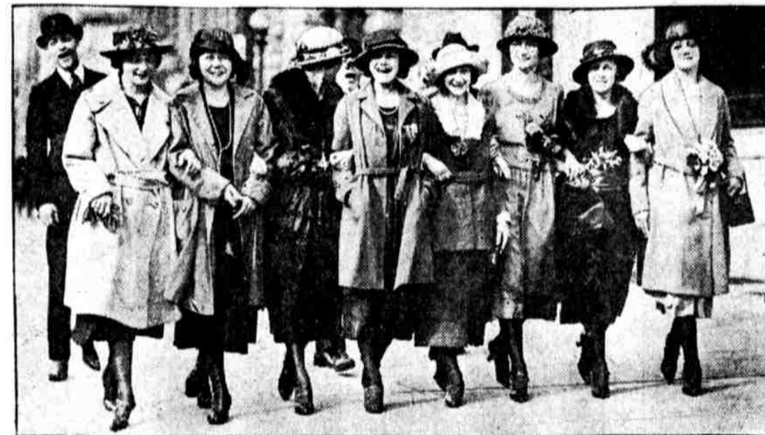
NOT ON THE BOARDWALK. There was another Easter Parade yesterday. It was on Broad street, north of Girard avenue. These eight girls, attired in their Easter toggety, were photographed at Broad street and Columbia avenue.