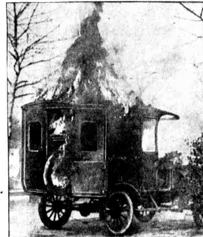
EASTER FLOWERS BURN. Late Saturday afternoon an N. Snellenburg & Co. delivery automobile was destroyed by fire on the Roosevelt Boulevard. Many Easter plants were ruined.