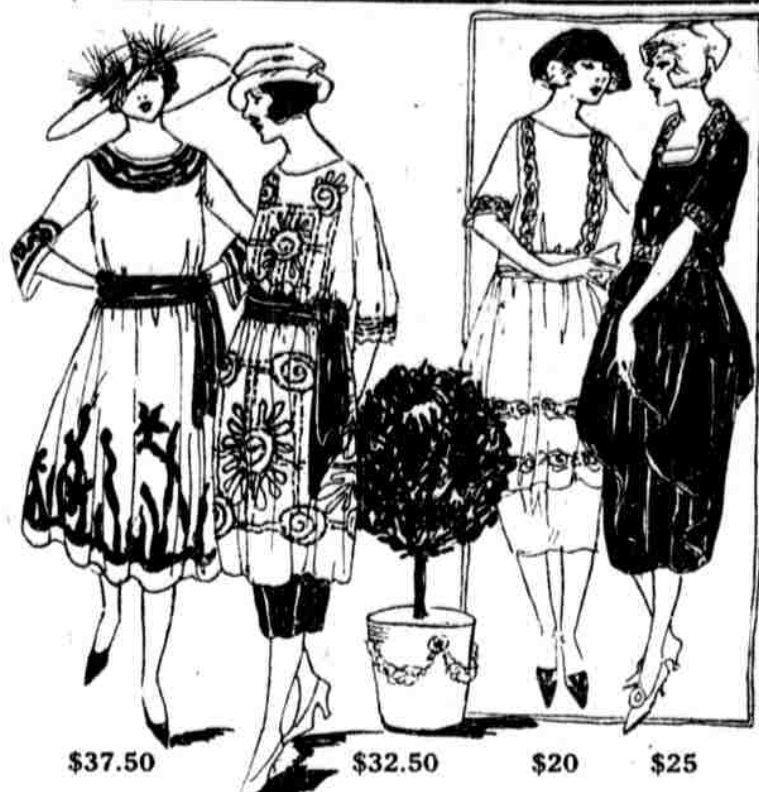
$37.50 $32.50 $20 $25

You'll Be Surprised at the Lovely Frocks That You Can Get for $20, $25, $29 to $39