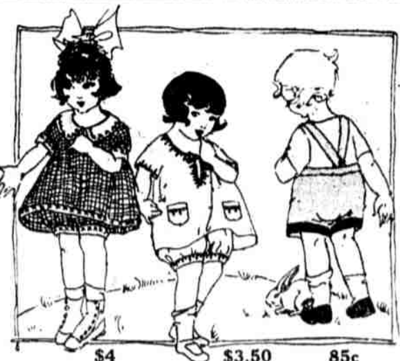
$4 $3.50 85c

Our fitting rooms and the help and advice of our expert fitters are at your service without charge. (Central)