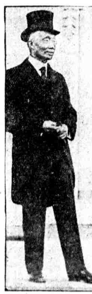
LEAVING THE WHITE HOUSE. Yung Kwai, Chinese diplomat, after an official visit.