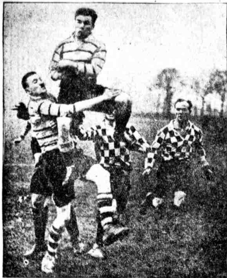
ONE WAY TO GET THROUGH THE LINE. The camera caught the British player in a Rugby match, away up in the air, with the ball clasped in his arms. A teammate is ready to protect him as he comes to earth.