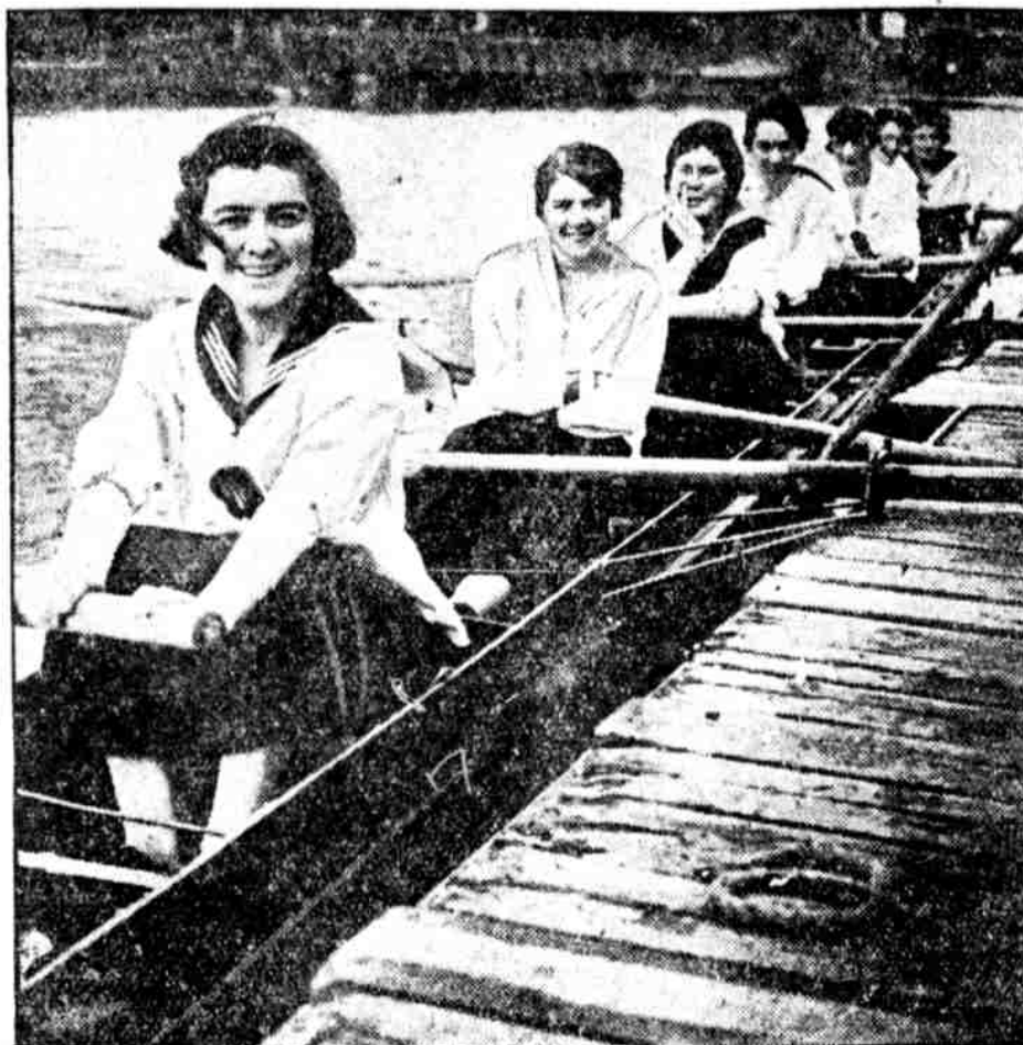
AT REST. "Pretty 'oarsmen'" who form the varsity eight of the St. Hilda's College, on the Thames, at Oxford, England. They are undergoing vigorous training in preparation for the early spring races.