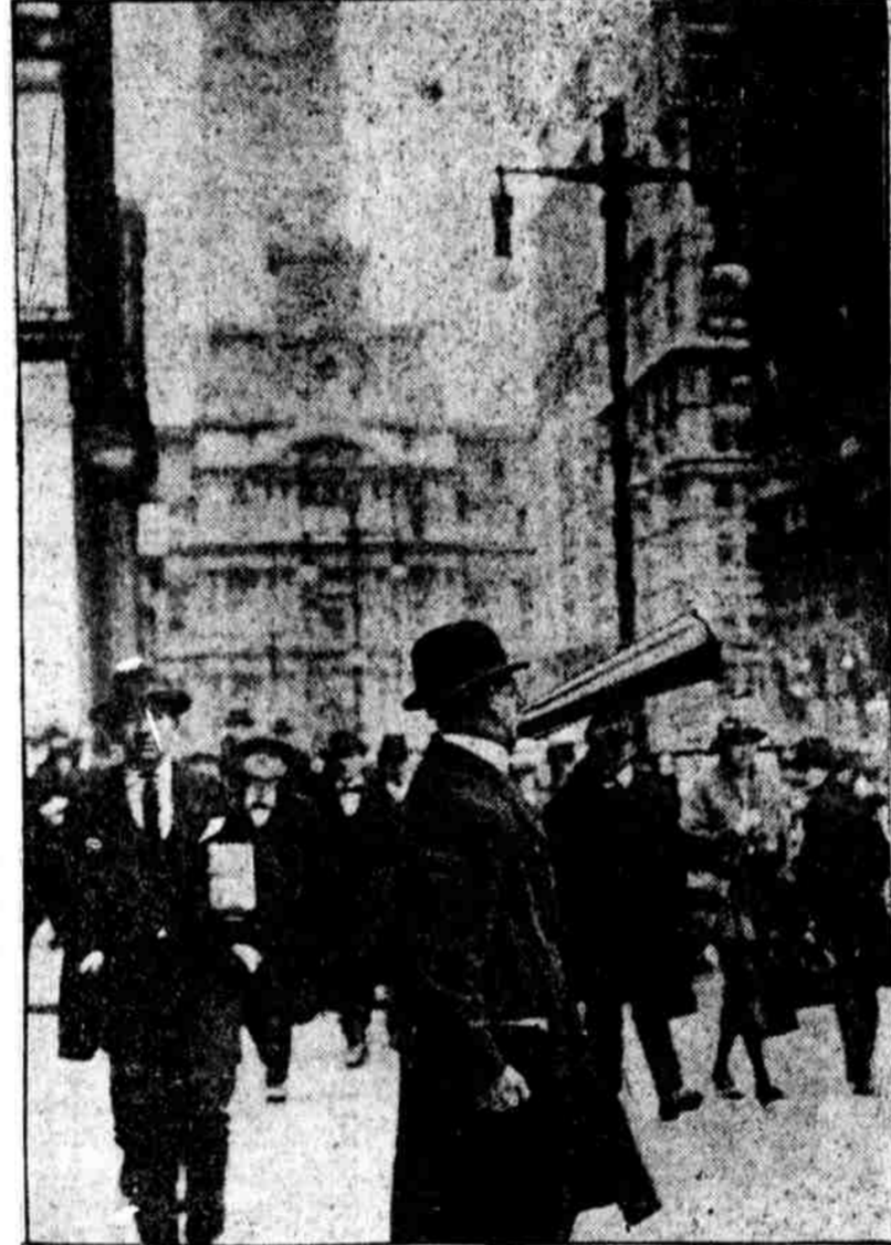
GOSPEL THROUGH MEGAPHONE. On Broad street below Walnut our photographer snapped the religious worker as he delivered his message to the noonday crowd.