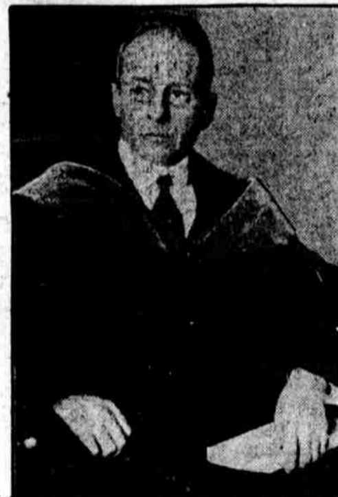
DOCTOR ANGELL, new president of Yale, posed at the office of the Carnegie Foundation in New York.