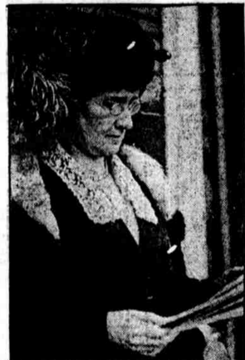
MISS FLORENCE KING, of Chicago, the only woman who ever won a case before the United States Supreme Court.