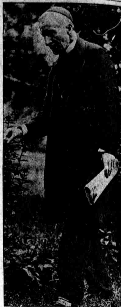
CARDINAL GIBBONS. This photograph was taken at Union Hills, Baltimore, while the distinguished prelate walked in his garden.