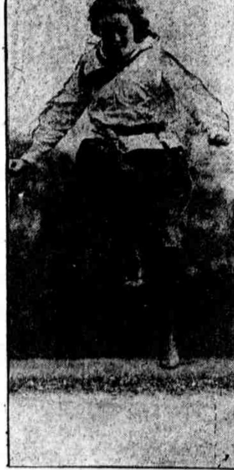
A FAIR HURDLER. A member of the New York Girl Scouts going over a wire fence in Bronx Park, N. Y., where her troop is camping.