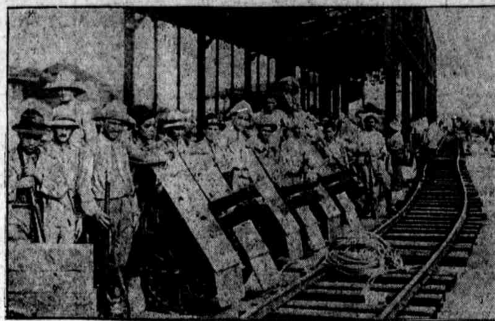
THEY WERE READY TO FIGHT. Costa Rican troops lined up on a pier with three 75 Skoda guns. This is one of the first pictures to arrive here from the scene of the Panama-Costa Rica troubles.